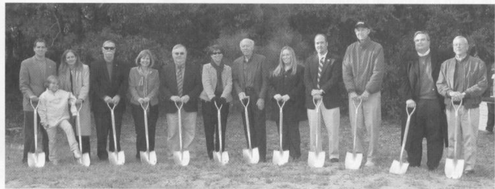
Town officials and invited guests helped to kick off the construction of Duck's 11-acre soundside park. Construction on Phase I will occur throughout 2007.

Currently, construction on Phase I of the park project is underway. The driveway, parking areas, playground area, and public kayak/canoe launch on the north end of the park property are in the process of being developed. Construction will continue throughout 2007.